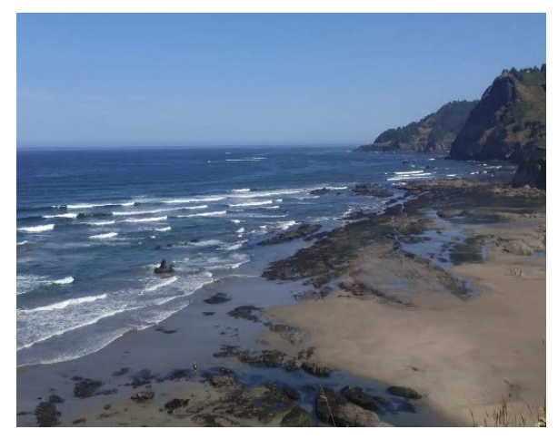
The rocky intertidal bays of the Pacific Northwest are at the global frontlines of ocean acidification.

Project Summary: Researchers and OA stakeholders at Oregon State University and the Pacific Shellfish Institute have partnered with NOAA to identify pathways for OA adaptation. The team will: